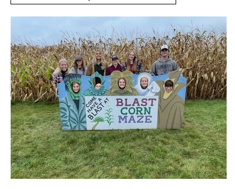
Junior Livestock members taking on the Blast Corn Maze at their meeting