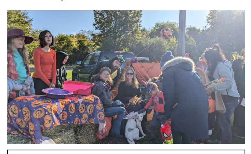
S & L Bauernhof 4-H Club participated in the Whitmore Lake Trunk or Treat. They served over 150-200 youth and their families and spread the word about 4-H