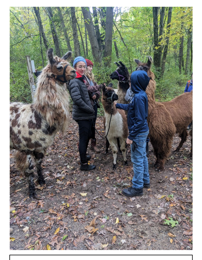
Double L Llama 4-H Club on their annual Fall Hike with the llamas